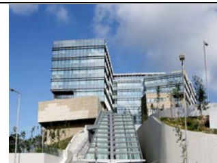
Photo: Lee Shau Kee Business Building